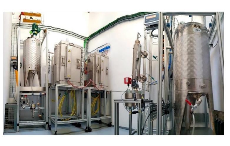
Figure 2: On left TCF pilot plant, on the right HDO pilot plant

FPBO, and the pyrolytic sugar fraction can be used as a raw material for the production of green polyols. In TCF, the pyrolytic sugars (PS) are obtained as a watery solution that can directly be processed in hydrogenation. Furthermore, the pyrolytic lignin fraction can be used in other added value applications such as various resin systems, minimalizing the production of waste residues. At BTG, the TCF process is performed on pilot-scale (see Figure 2). The pyrolytic sugar