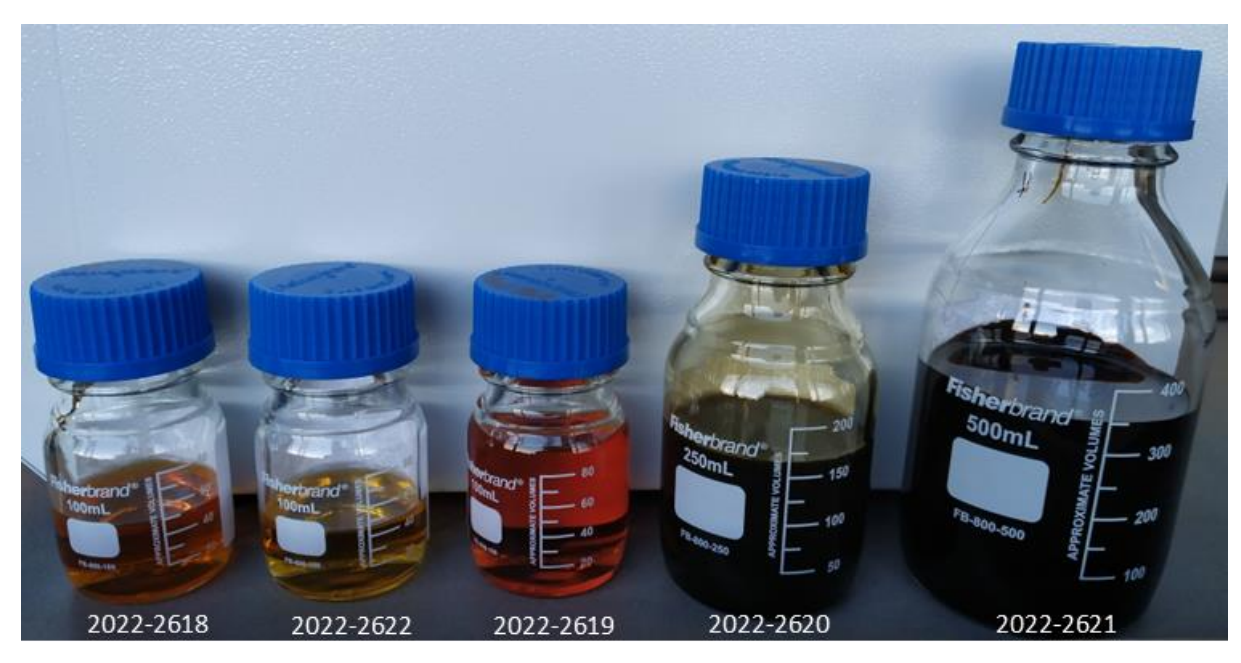
Figure 3: Examples of polyol samples

<sup>1</sup>: SPO: Stabilized pyrolysis oil, <sup>2</sup>: Stabilized pyrolytic sugars